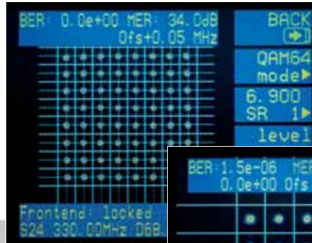
Constellation diagram of a QAM64 signal

Level values, frequencies and the entire frequency spectrum can be printed out via the integrated dot-matrix printer.